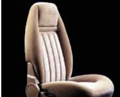
Seating systems for Chrysler.